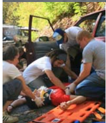
These Images Are From October Open Enrollment Courses With Landmark Learning.

Want to learn more about Landmark Learning instructors? Follow this link to our websites new Instructor page!